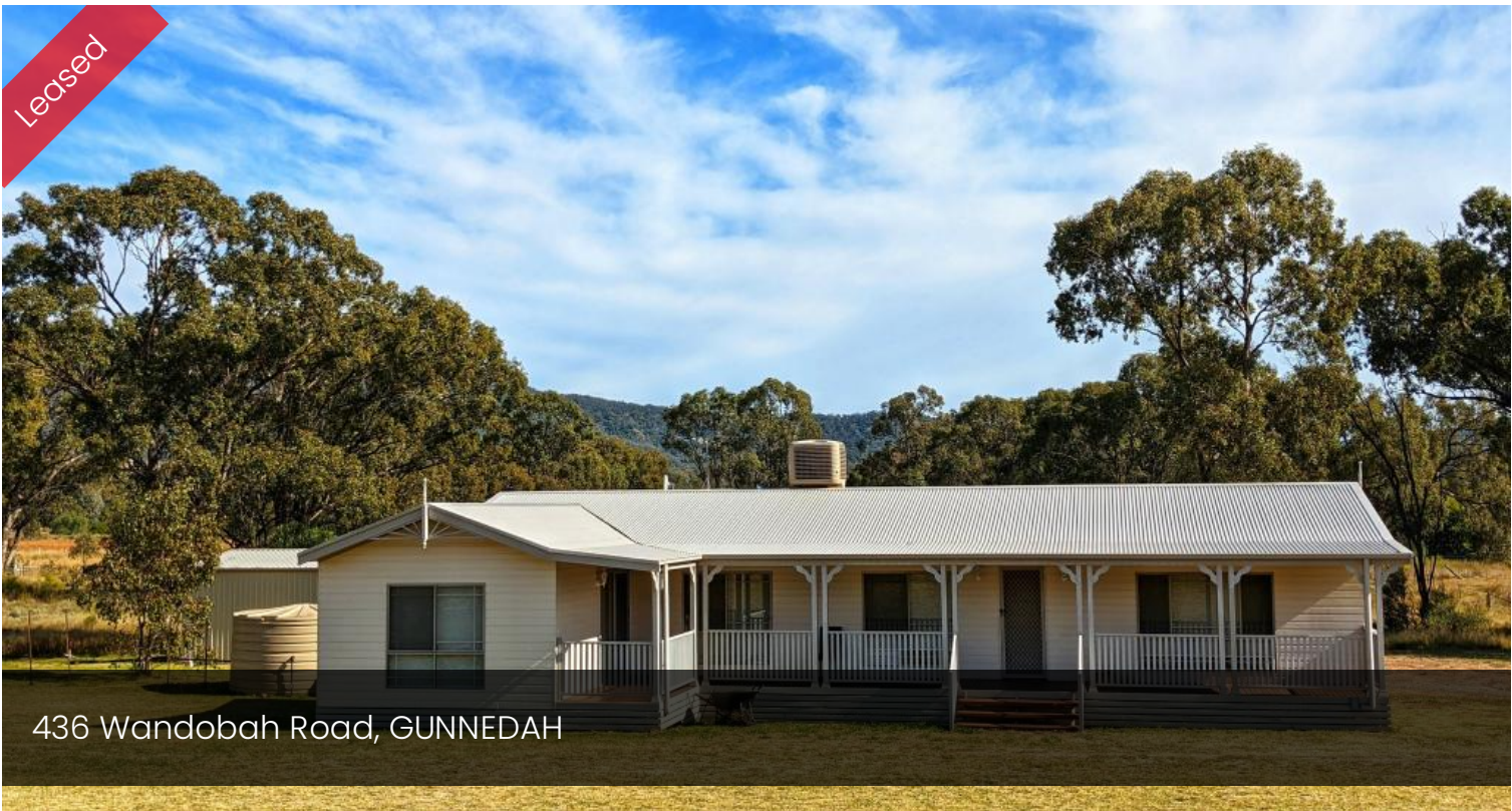
436 Wandobah Road, GUNNEDAH