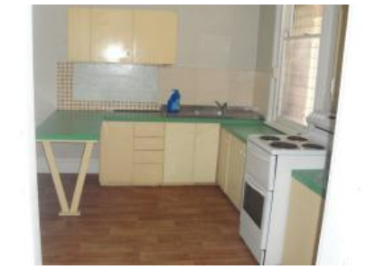
🛱 2 🖺 1

The above information provided has been furnished to us by the vendor/s. We have not verified whether or not that information is accurate and do not have any belief in one way or the other in its accuracy. We do not accept any responsibility to any person for its accuracy and do no more than pass it on. All interested parties should make and rely upon their own inquiries in order to determine whether or not this information is in fact accurate.