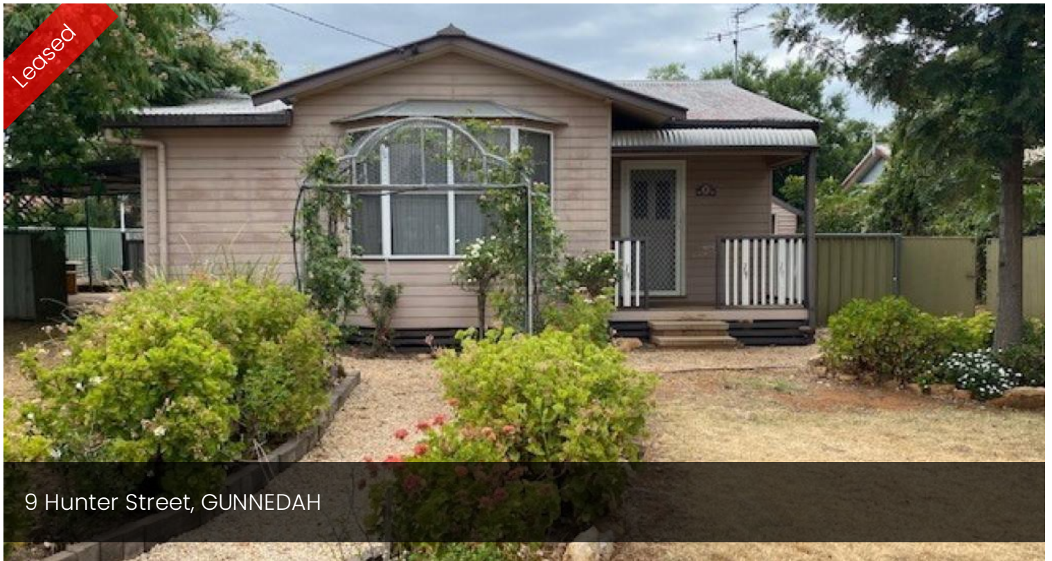
9 Hunter Street, GUNNEDAH