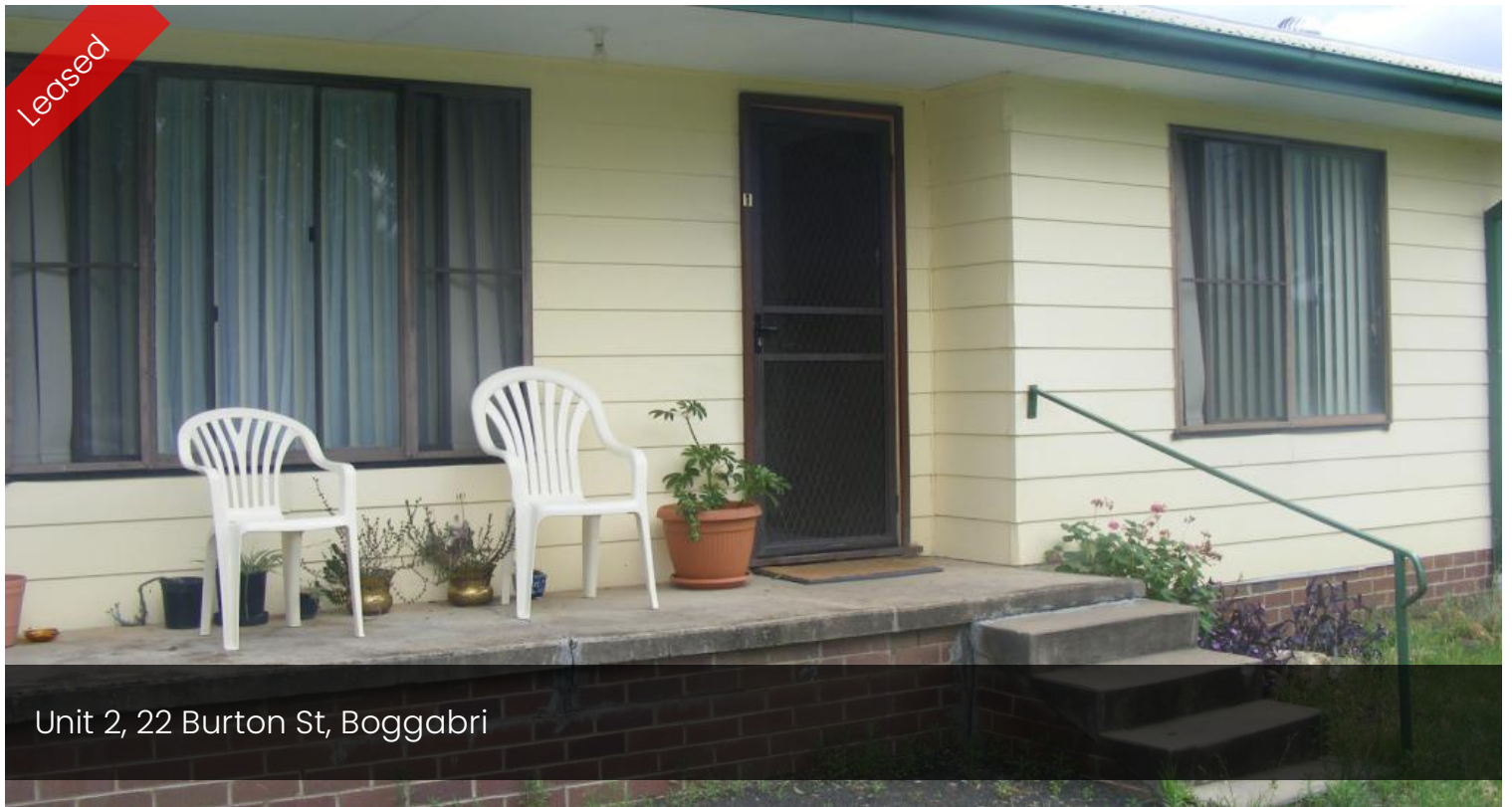
Unit 2, 22 Burton St, Boggabri