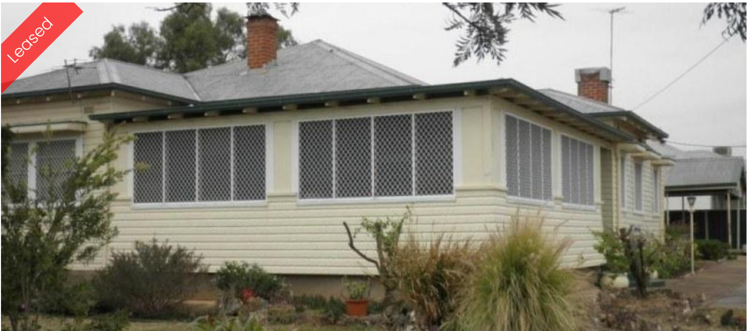
Unit 1, 393 Conadilly St, Gunnedah