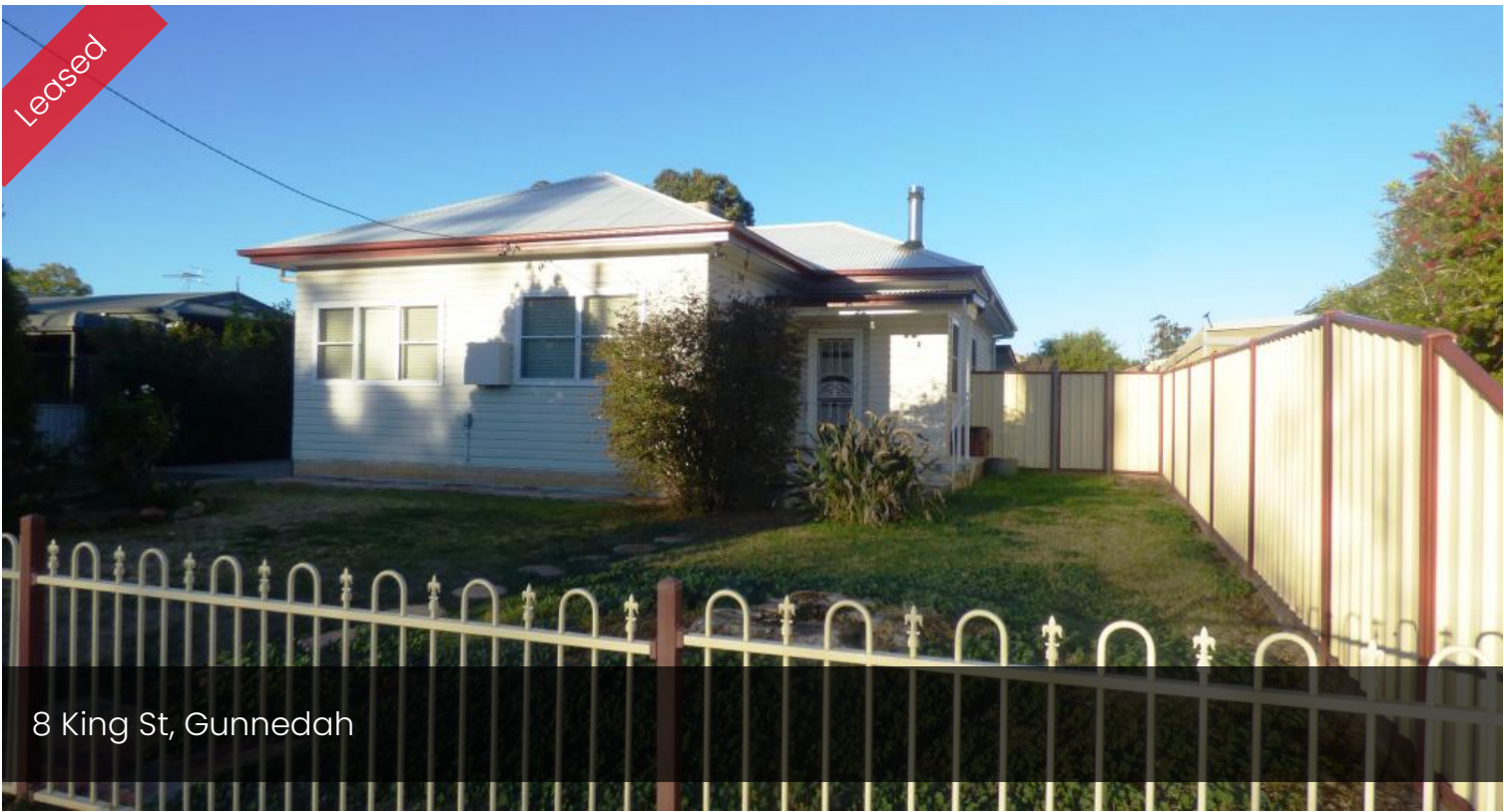
8 King St, Gunnedah