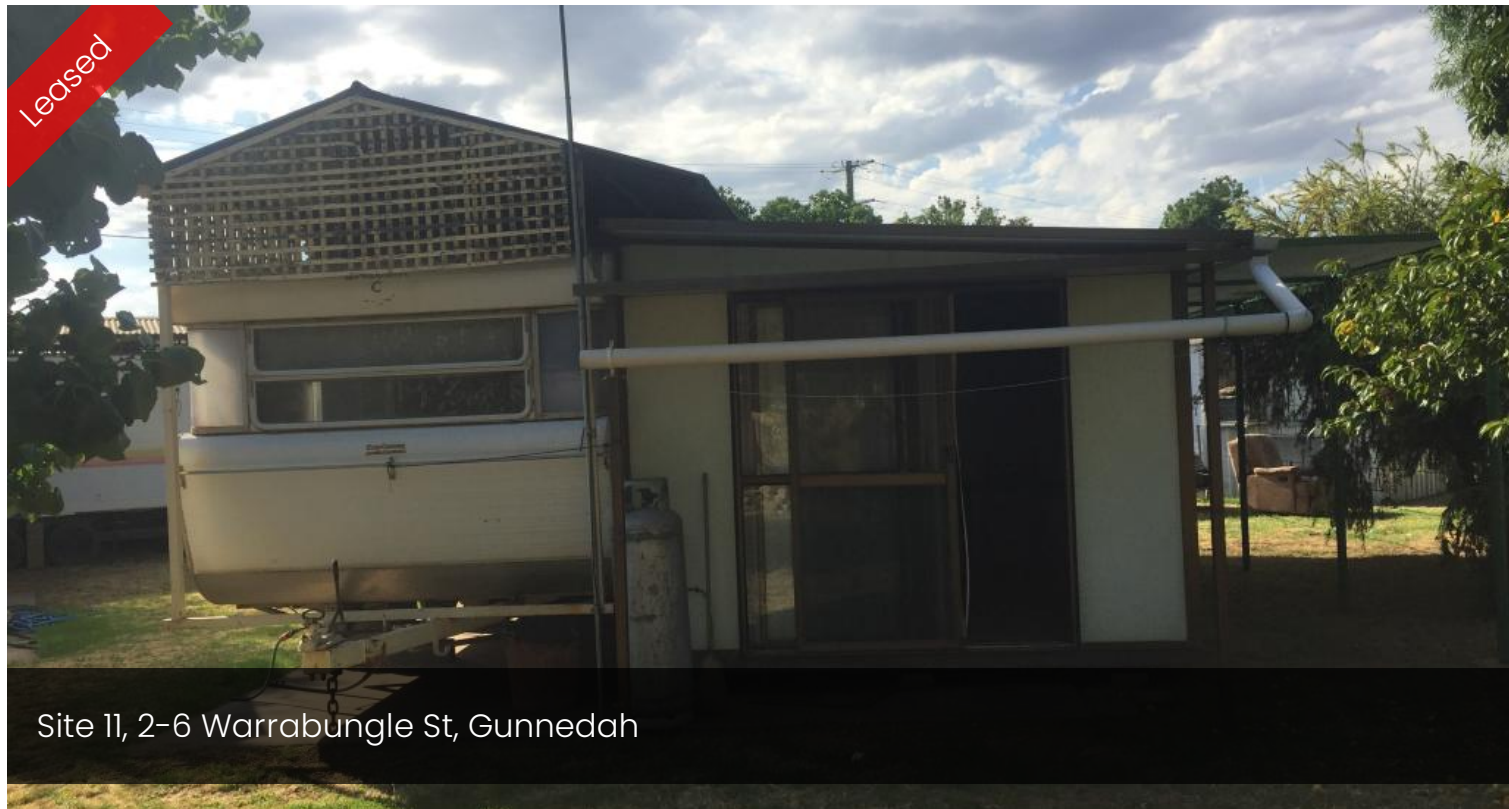
Site 11, 2-6 Warrabungle St, Gunnedah