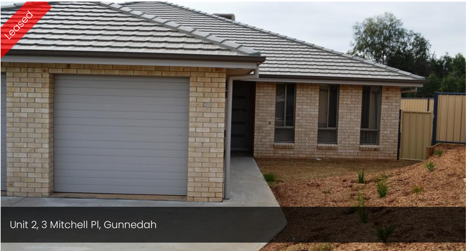
Unit 2, 3 Mitchell Pl, Gunnedah