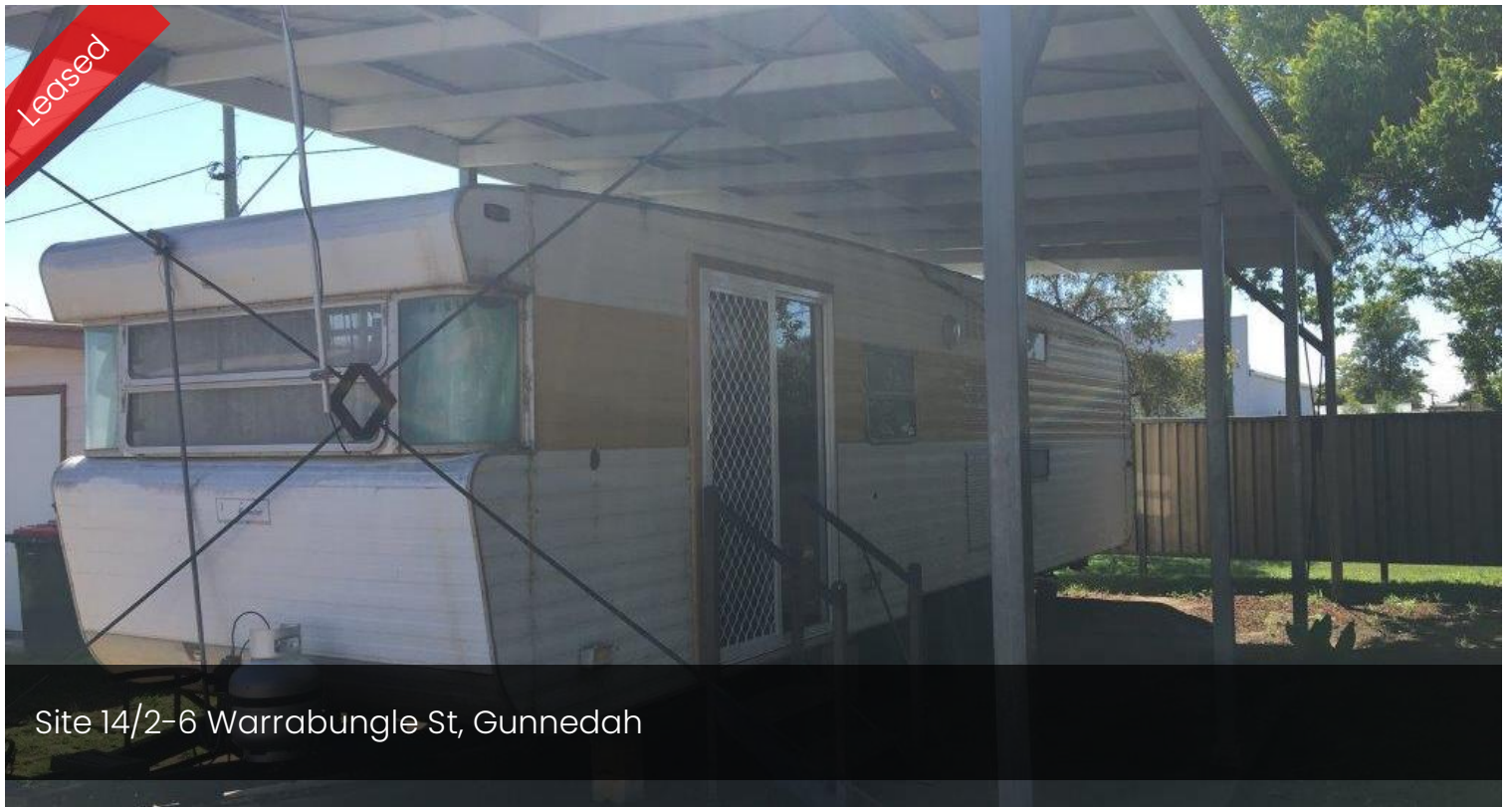
Site 14/2-6 Warrabungle St, Gunnedah