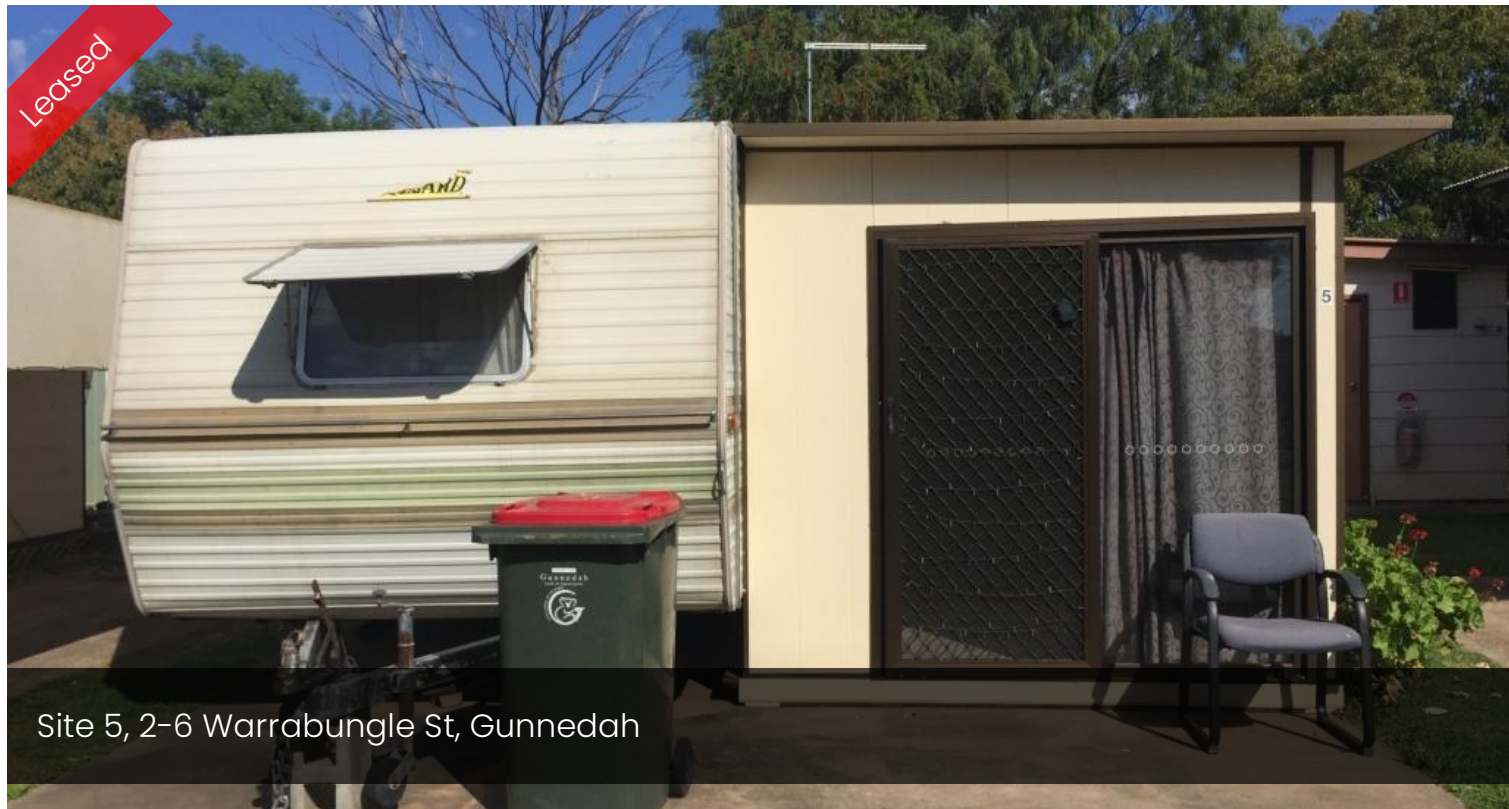
Site 5, 2-6 Warrabungle St, Gunnedah