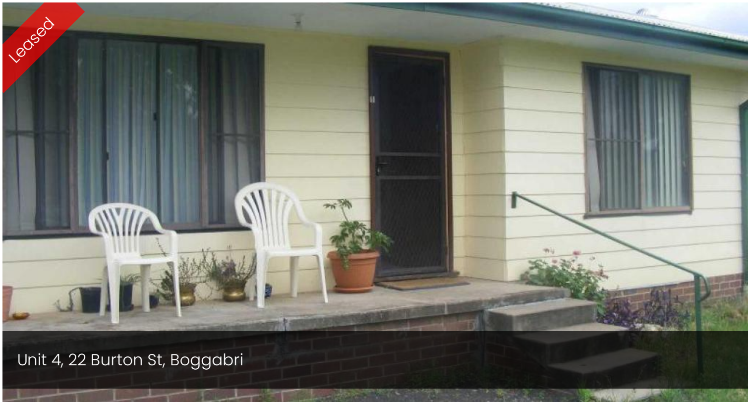
Unit 4, 22 Burton St, Boggabri