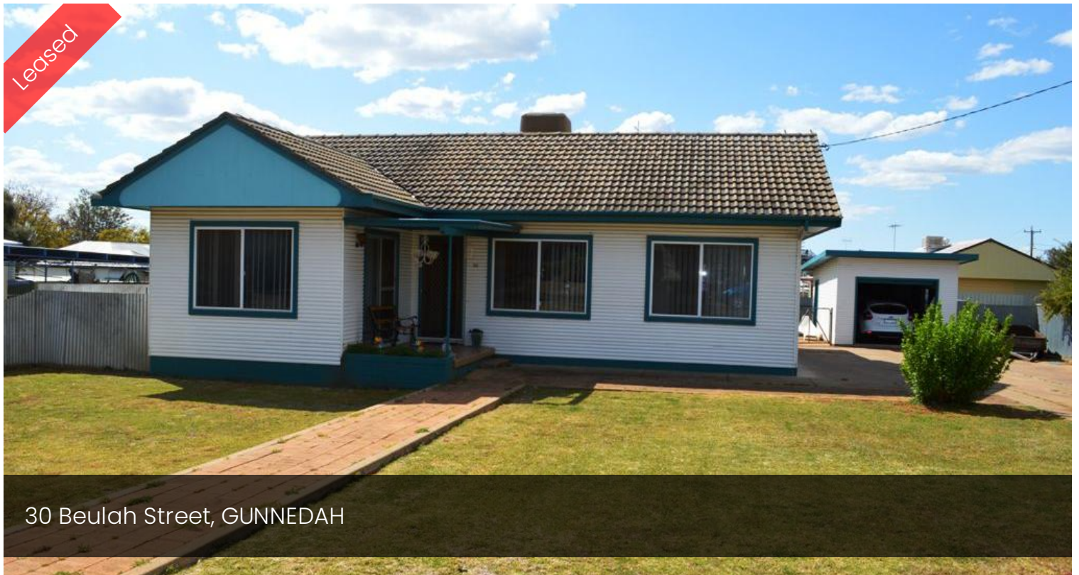
30 Beulah Street, GUNNEDAH