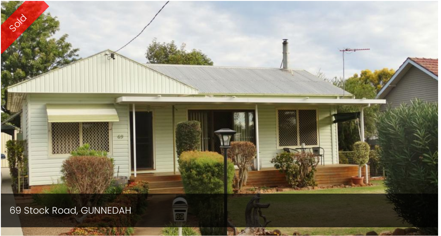
69 Stock Road, GUNNEDAH