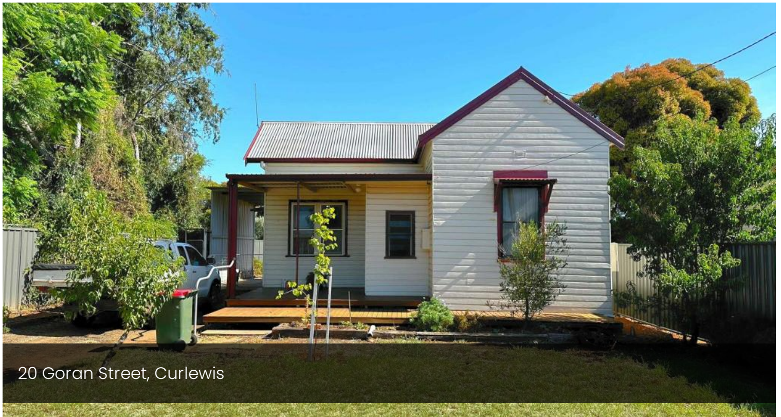
20 Goran Street, Curlewis