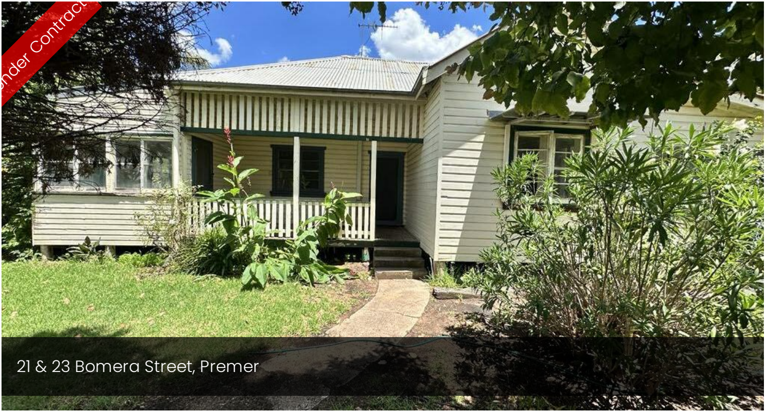
21 & 23 Bomera Street, Premer