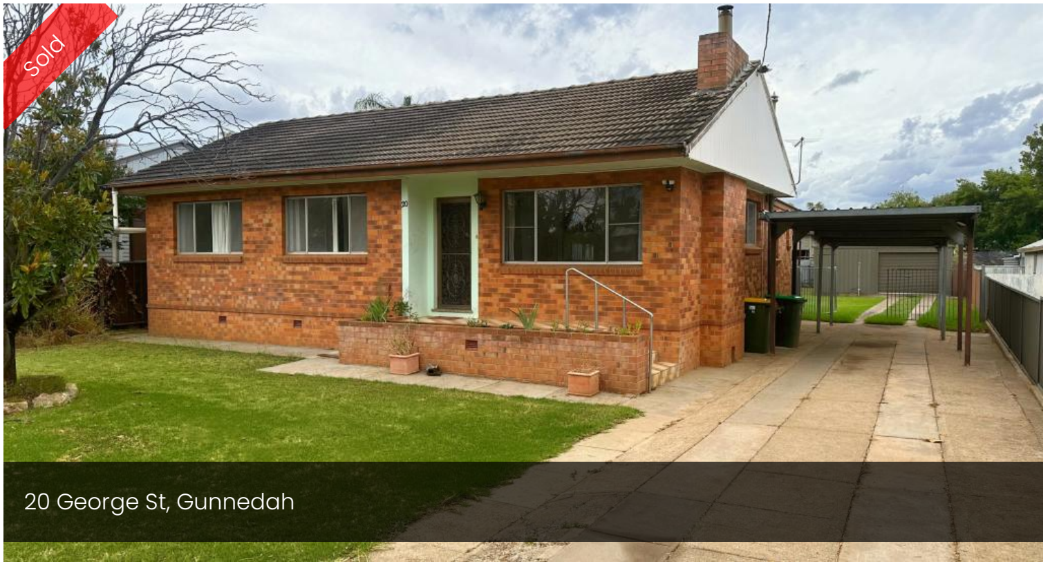
20 George St, Gunnedah