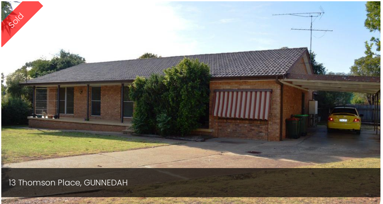
13 Thomson Place, GUNNEDAH