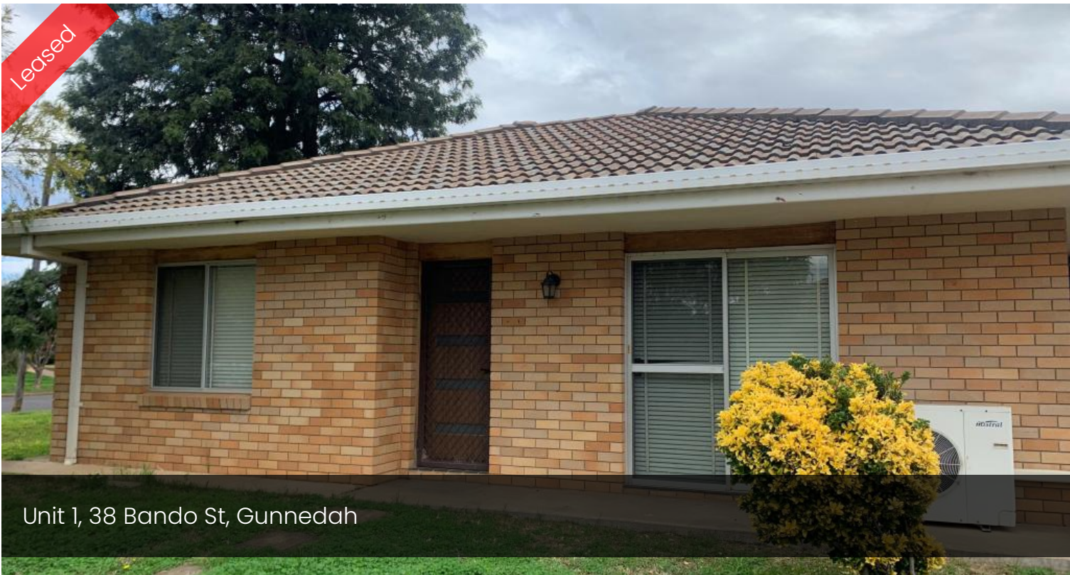
Unit 1, 38 Bando St, Gunnedah