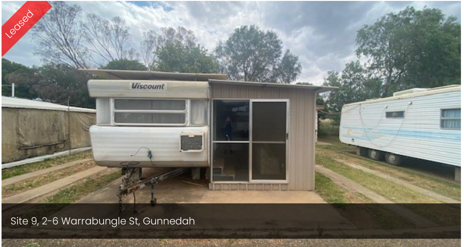
Site 9, 2-6 Warrabungle St, Gunnedah