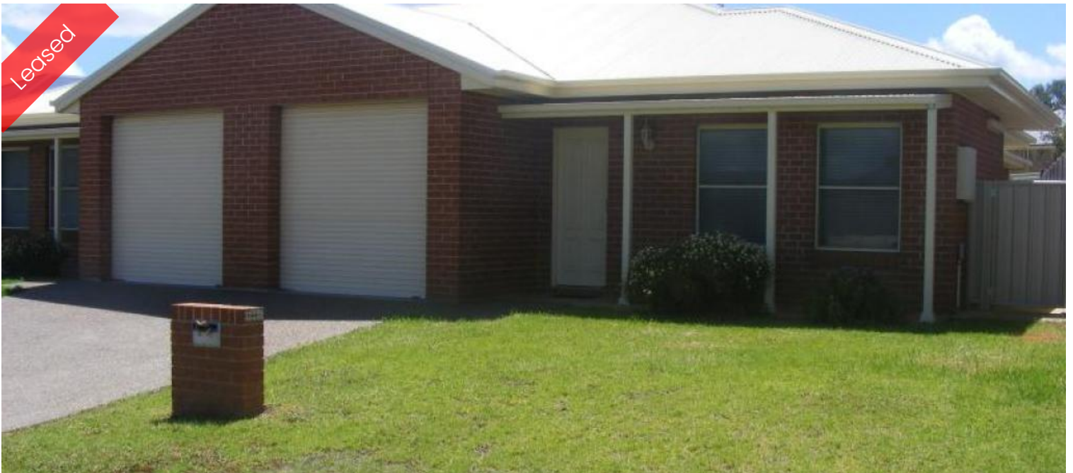
Duplex, 2/20 Hinton Drive, GUNNEDAH