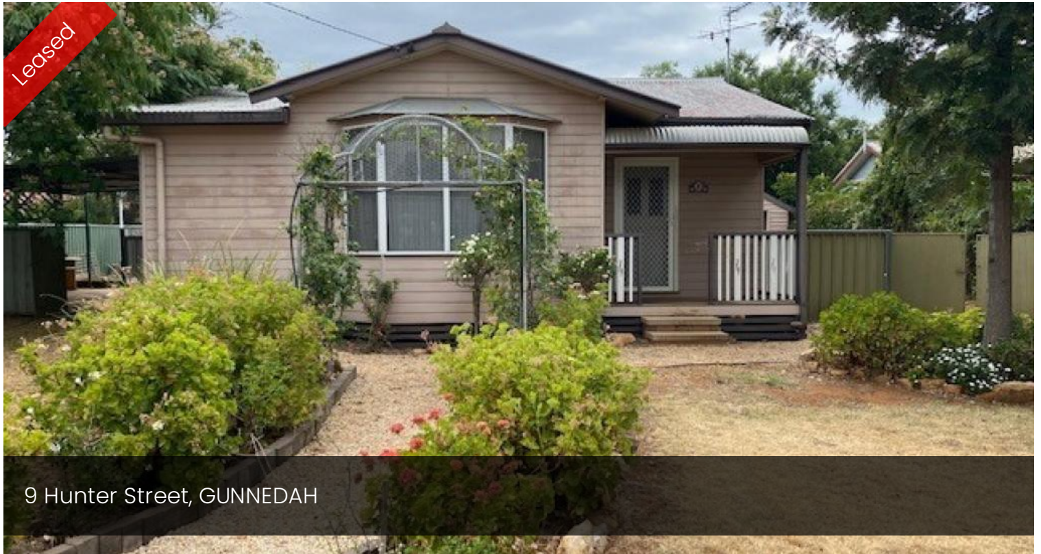
9 Hunter Street, GUNNEDAH